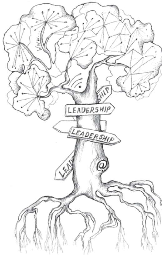
Figure 12.1 Eco-leadership